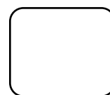
Ottoman or Footstool